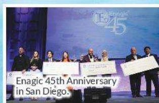
Enagic 45th Anniversary in San Diego