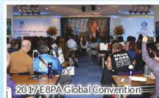
2017 E8PA Global Convention