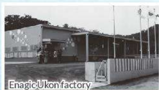
Enagic Ukon factory

Enagic Ukon factory is opened in Sedake.