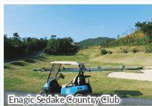
Enagic Sedake Country Club