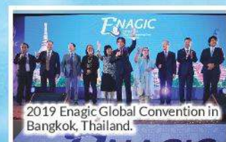
2019 Enagic Global Convention in Bangkok, Thailand