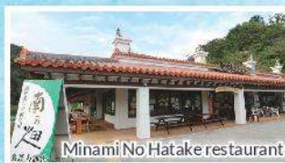
Minami No Hatake restaurant