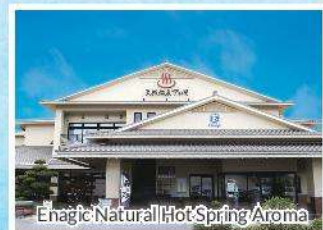
Enagic Natural Hot Spring Aroma