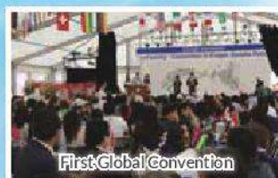
First Global Convention