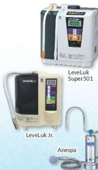
LeveLuk Super 501