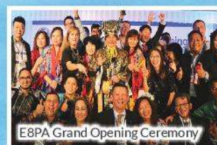
E8PA Grand Opening Ceremony