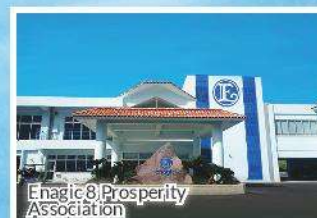
Enagic 8 Prosperity Association