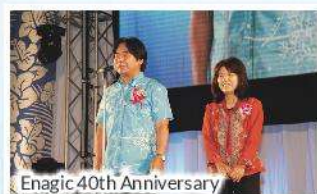
Enagic 40th Anniversary