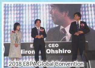
2018 E8PA Global Convention

2018 E8PA Global Convention in Kuala Lumpur, Malaysia.