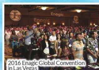
2016 Enagic Global Convention in Las Vegas