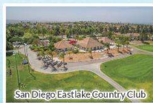
San Diego Eastlake Country Club