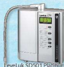
LeveLuk SD501 Platinum

Opens Minami No Hatake restaurant & Enagic Natural Hot Spring Aroma.