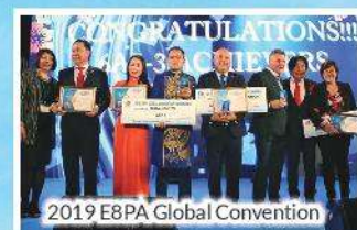
2019 E8PA Global Convention