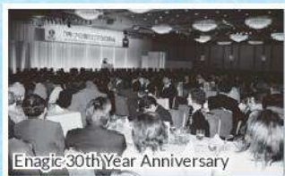
Enagic 30th Year Anniversary