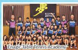
Enagic Table Tennis Academy