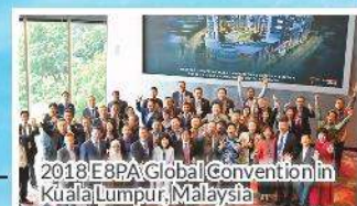
2018 E8PA Global Convention in Kuala Lumpur, Malaysia