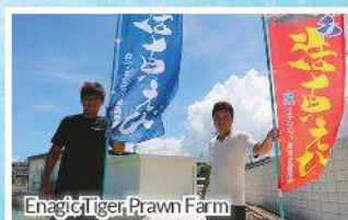
Enagic Tiger Prawn Farm