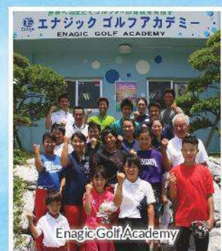
Enagic Golf Academy