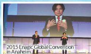
2015 Enagic Global Convention in Anaheim