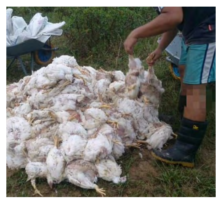
Mr Syahidin's dead chickens before the usage of "Anode" water.

Besides that, the most prominent changes can be seen is the death toll for the chickens have been significantly reducing from 16% to only 1 % by changing the water! With that, Syahidin has been able to reduce the loss and maximize his profit!