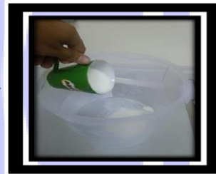
9) Pour 1 glass citric acid onto the container