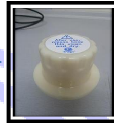
4) Take out CPU-N