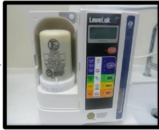
2) Remove cover