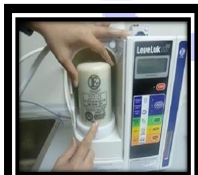
20) Put your filter back in (When storing your CPU don't store it wet with the lid on, allow it to completely dry.)