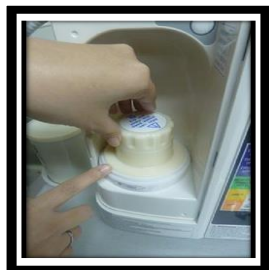
19) Remove the CPU