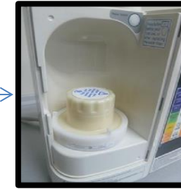
5) Place the CPU in the machine where the filter was.