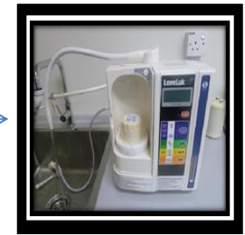
18) Connect white hose to tap water. Then rinse the machine by running water for 5 minutes