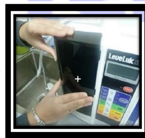
21) Put your cover back in.