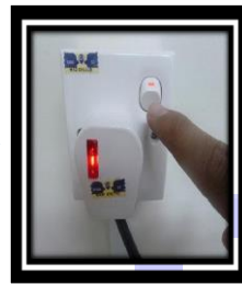
14) Power on the pump.