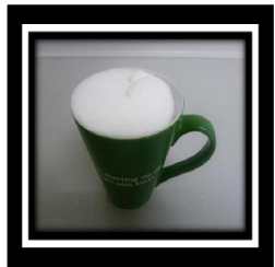
7) Prepare 1 glass citric acid