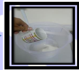
10) Pour 1 glass hot water onto the container