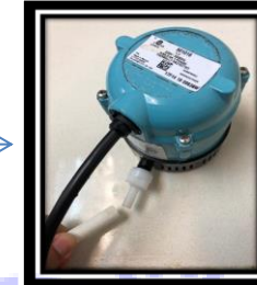
17) Disconnect white hose from pump hose.