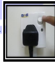
16) Power off the pump.