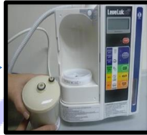
3) Remove the filter