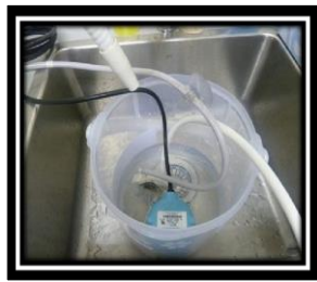
13) Place pump and acidic hose (grey hose) into the container.