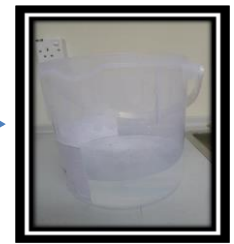
12) Add 1 liter tap water onto the container.