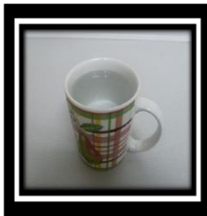
8) Prepare 1 glass hot water