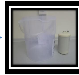
6) Prepare 1 container