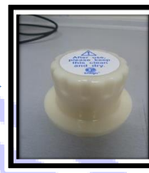
4) Take out CPU