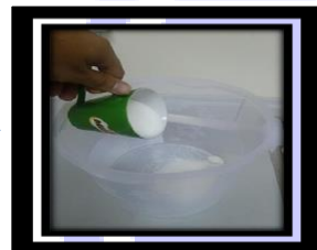
9) Pour 1 glass citric acid onto the container