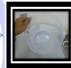
11) Dissolve the solution