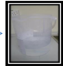
12) Add 1 liter tap water onto the container.