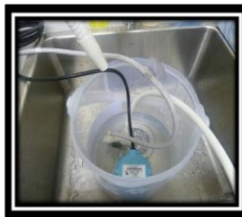
14) Place pump and acidic hose (grey hose) into the container.