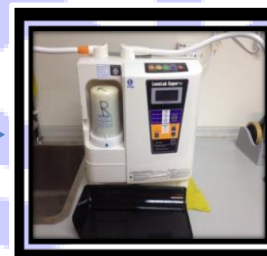
22) Install filter back in