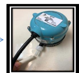
18) Disconnect white hose from pump hose.