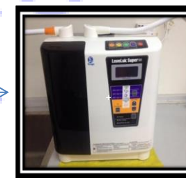
23) Put your cover back in.