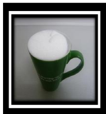
7) Prepare 1 glass citric acid