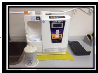
3) Remove the filter