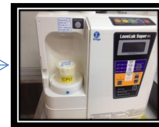
5) Place the CPU in the machine where the filter was.