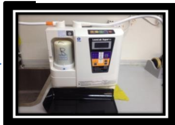
2) Remove cover