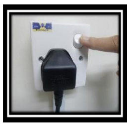
1) Turn off the machine