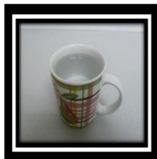
8) Prepare 1 glass hot water