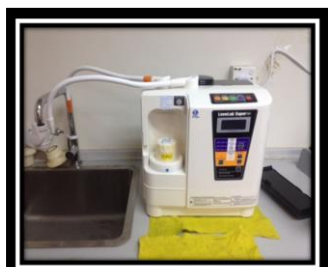
19) Connect white hose to tap water. Then rinse the machine by running water for 5 minutes

*** For SUPER501 got TWO CHAMBER, we have to run deep cleaning for both chamber *** Repeat step 9 until step 19 for one more hose