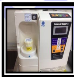
21) Remove the CPU

*** For SUPER501 got TWO CHAMBER, we have to run deep cleaning for both chamber *** Repeat step 9 until step 19 for one more hose