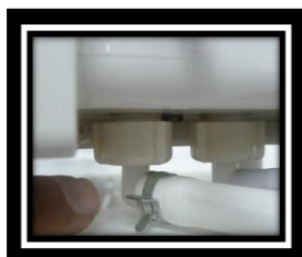
13) Connect white hose with pump hose. ( You must connect from the bottom )