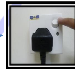
17) Power off the pump.