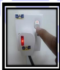
15) Power on the pump