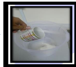
10) Pour 1 glass hot water onto the container